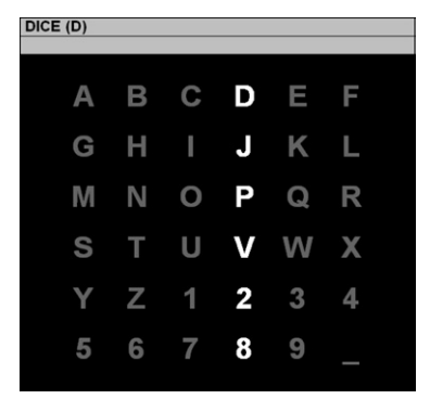
Figure 1. The 6 \times 6 matrix used in the current study. A row or column intensifies for 100 ms every 175 ms. The letter in parentheses at the top of the window is the current target letter 'D'. A P300 should be elicited when the fourth column or first row is intensified. After the intensification sequence for a character epoch, the result is classified and online feedback is provided directly below the character to be copied.

The EEG was recorded using a cap (Electro-Cap International, Inc.) embedded with 64 electrode locations distributed over